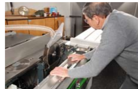
Rise and fall, and tilt mechanism of the saw blade is operated digitally or through a dial

I have always been impressed with the planer thicknesser, particularly with the System Felder self-setting blades. The