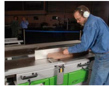
The vertical adjustment on the new machine eliminates misalignment of the fence carrying edge